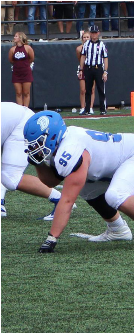
The Bulldogs stayed within a touchdown of No. 14 Montana until late in the third quarter.